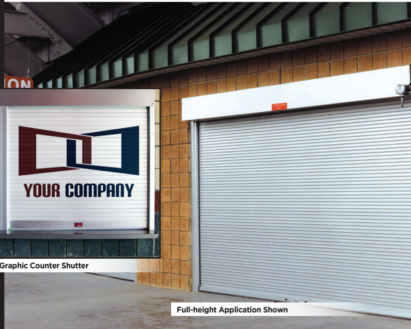
Full-height Application Shown