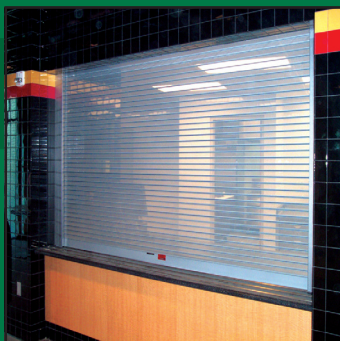
ScreenGard™ Perforated Shutter Curtain