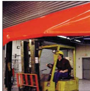
Fork lift crashes through