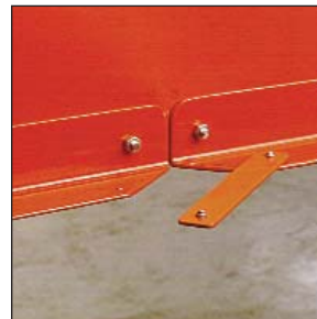
Align holes in flats with holes in bottom bar.