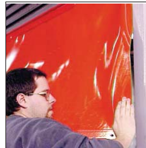
Matadoor® slips easily back into the guides