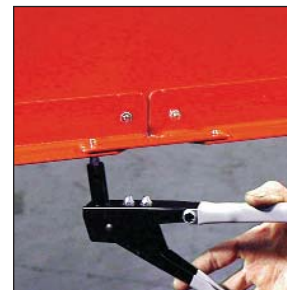
Use the fasteners supplied to re-attach the flat.