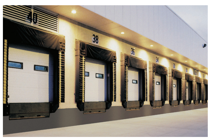
TC300, White with Rectangle Windows

Designed for optimum strength and performance, this door's 20-gauge exterior steel skin and rugged hardware provides the ultimate in dependability. Raynor TC320 is ideal in applications where security and thermal protection are required.