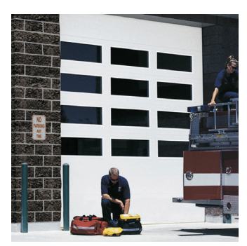
TC Series, TC300

Raynor also offers a full line of sectional, rolling, fire, high performance and traffic doors, as well as, security grilles. See your Raynor Dealer or visit www.raynor.com for more information.