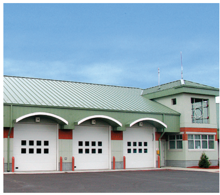
TC200, White with Colonial Windows